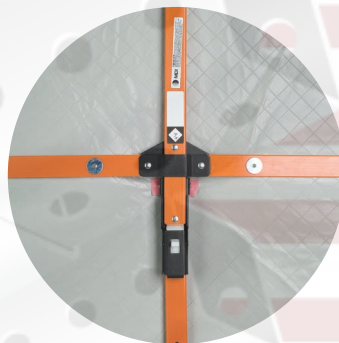
Single trigger release.