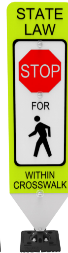
Single-Sided "STATE LAW" STOP (R1-6A) (Shown)