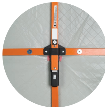
Single trigger release.