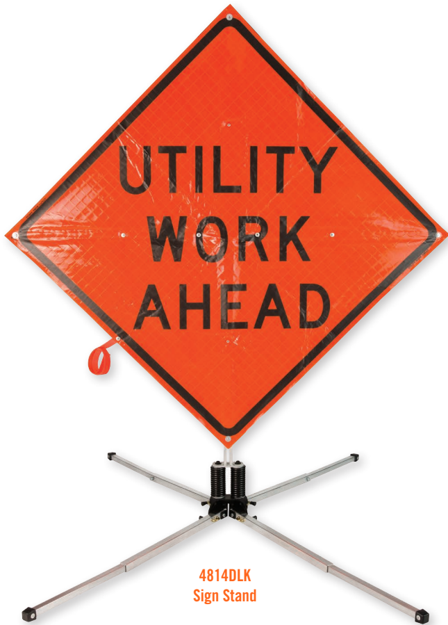
4814DLK Sign Stand

The MDI Compact Collapse & Wrap Sign System is comprised of an MDI Compact sign and a WindMaster sign stand ( each sold separately ).